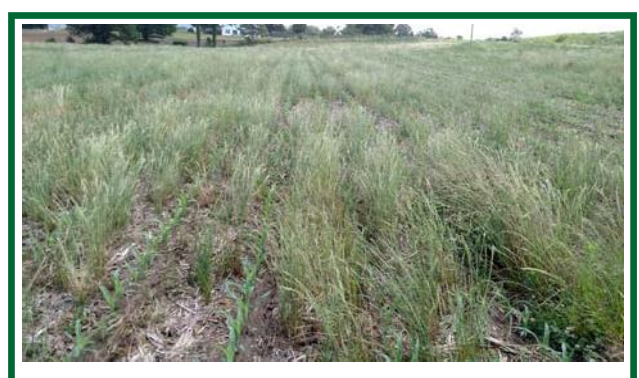
Figure 5. Failed control of annual ryegrass prior to corn planting resulting in crop competition and seed production.

Termination timing in the event another application or different method is required. Occasionally multiple herbicide applications will be required to successfully terminate a cover crop (Figure 5). Early termination allows for flexibility should a second application be needed.