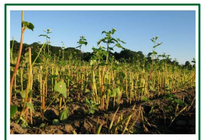
Figure 2. Flowering regrowth in buckwheat shortly after failed termination by mowing.

In systems that include tillage, or are managed organically, mechanical soil disturbance can be a reliable method of cover crop termination. A moldboard plow is the most effective tool to manage dense stands of overwintering cover crops. Chisel plowing is also an effective method for termination of most cover crops. However, multiple passes may be required if large amounts of cover crop biomass are present. Rototillers can also terminate cover crops when biomass levels are low enough to avoid clogging. Vertical tillage tools are not reliable for cover crop termination. Mowing is also not a reliable method of terminating most cover crops (Figure 2).