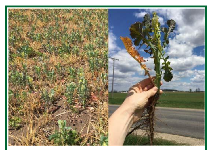
Figure 4 Glyphosate terminated the cereal rye (left), but failed to control bolting rapeseed (right) in this two-species mix-ture.

Termination prior to flowering. Plants that have started to flower (reached the reproductive stage) may be difficult to control as the movement of photosynthates change in the plant, thereby altering the movement of herbicides that are translocated (Figure 4).